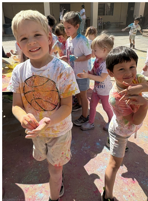
Our 3’s and Pre-K classes celebrated the Holi Festival in March