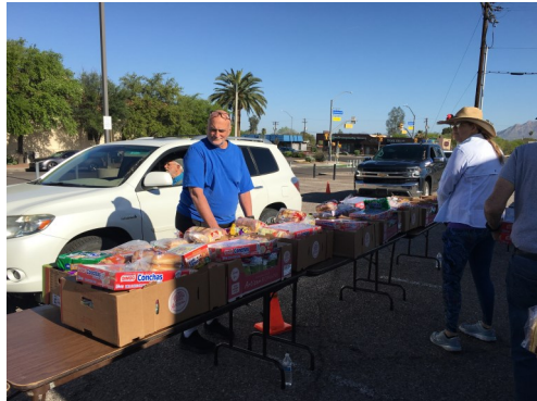
Last year's Market on the Move serving our neighborhood with fresh produce