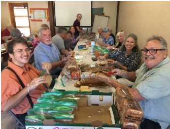
PB&J Volunteers at work

Primavera Men's Shelter – Another successful outreach at the Primavera Men's Shelter was completed on May 27th. Our next event will be on Saturday, June 24th. We plan this outreach on the 4 th Saturdays each month in 2023, 2-6pm. The menu is planned, and grocery shopping is done by team leaders. The work involves standing and lifting while cooking and serving. All volunteers who are vaccinated, gloved, and over the age of 12 are welcome. (Masks may be required). Who wants to help on Saturday, June 24th?