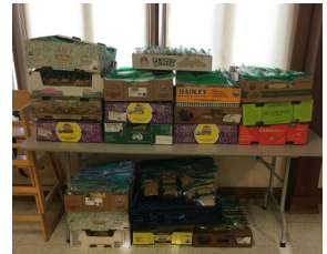
1200 PB&J sandwiches

team of 3 volunteers cook and serve our summer recipe of "taco salad," made from scratch, for more than 200 of our neighbors suffering from homelessness and hunger. All the grocery shopping is done by a team leader. This work involves standing, lifting, cooking, and serving in a very small kitchen. All volunteers who are vaccinated, gloved, and over the age of 12 are welcome. (Masks may be required). We need 2 more volunteers for July 1 st .