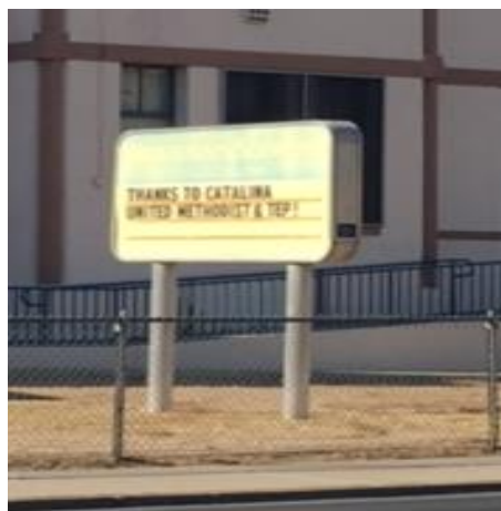
Thanks to Catalina United Methodist and TEP!

Catalina UMC Methodist Men's Virtual Breakfast Saturday, January 9, 2021 8 a.m. to 9:00 a.m. ZOOM online Meeting click below Who is behind the screen? https://us02web.zoom.us/j/87602142208 “How the online services are prepared and launched”